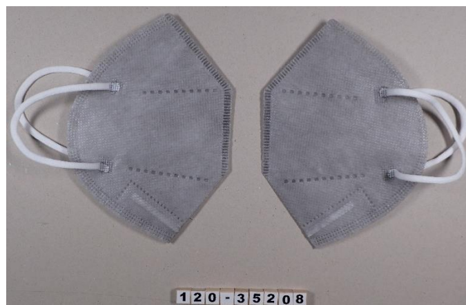
SEQUOIA VIRALSHIELD SVSG.20 1.0